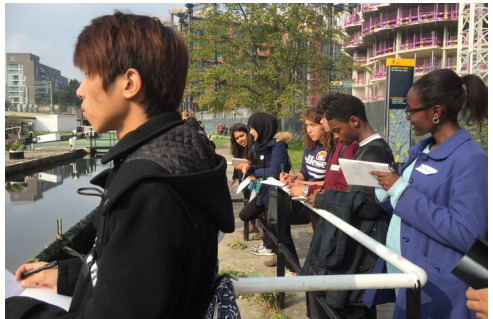
Skills Development Workshops